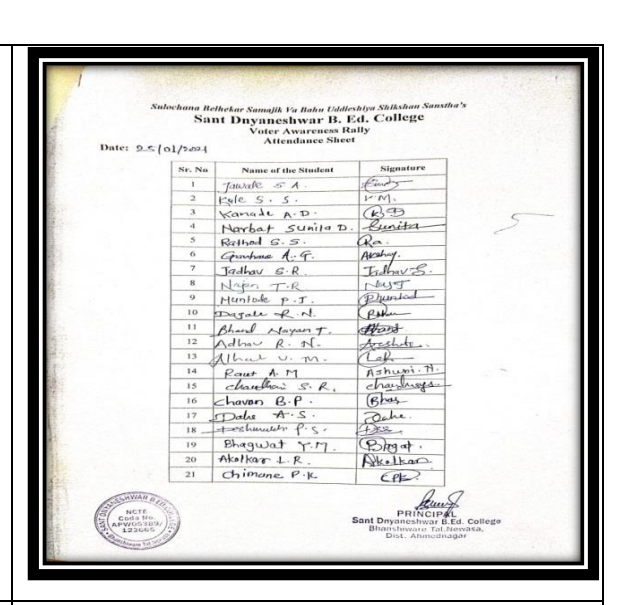
Notice of the Rally